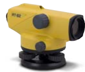
AT-B2 High-precision model

Accuracy, Durability, Ease-of-Use, and Ruggedness that Exceed Your Expectations