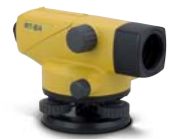
AT-B4 Economical model for engineering and construction