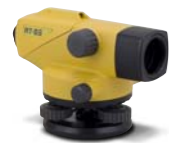
AT-B3 Versatile model for surveying, engineering and construction